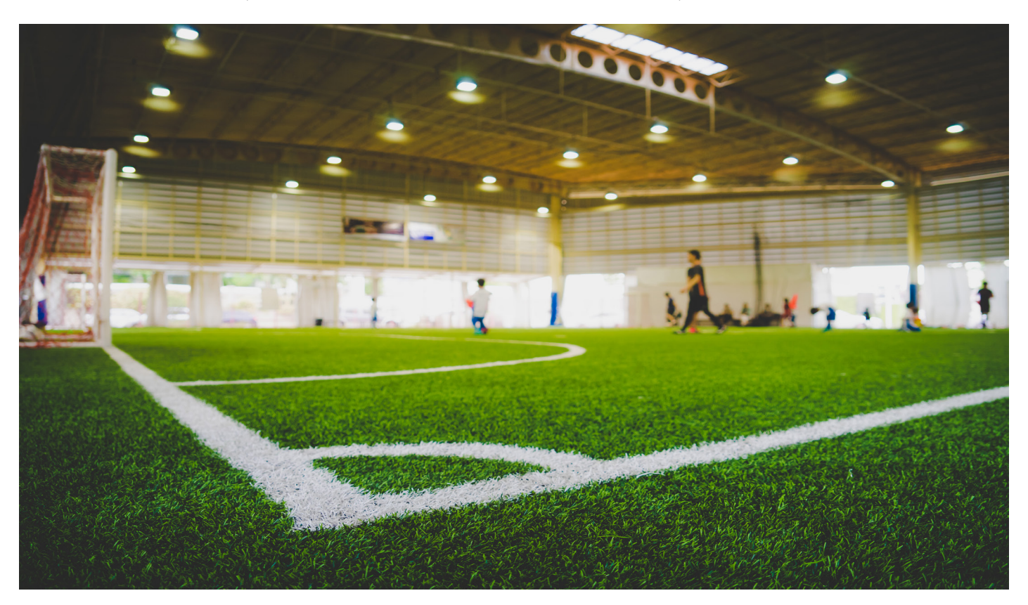
CSO envisions a polished, professional state of the art facility modeled on other similar venues across the country.

In short, the finished facility will have a tremendous impact on the community.